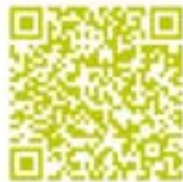
Grow or Die

Deep and Wide Student Ministry has just completed a chapter by chapter and verse by verse study through 1 Corinthians. Most of the messages can be found on our Grow or Die podcast. January 31st we will begin a new journey through 2 Corinthians. We will be posting each message on the podcast, join us on this journey. Either we are Growing or Dying as believers, lets Grow!