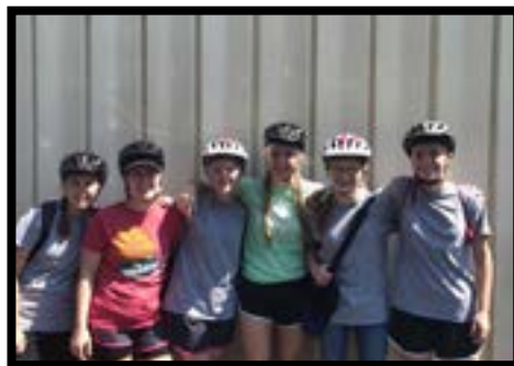
Trip to the Creeper Trail!